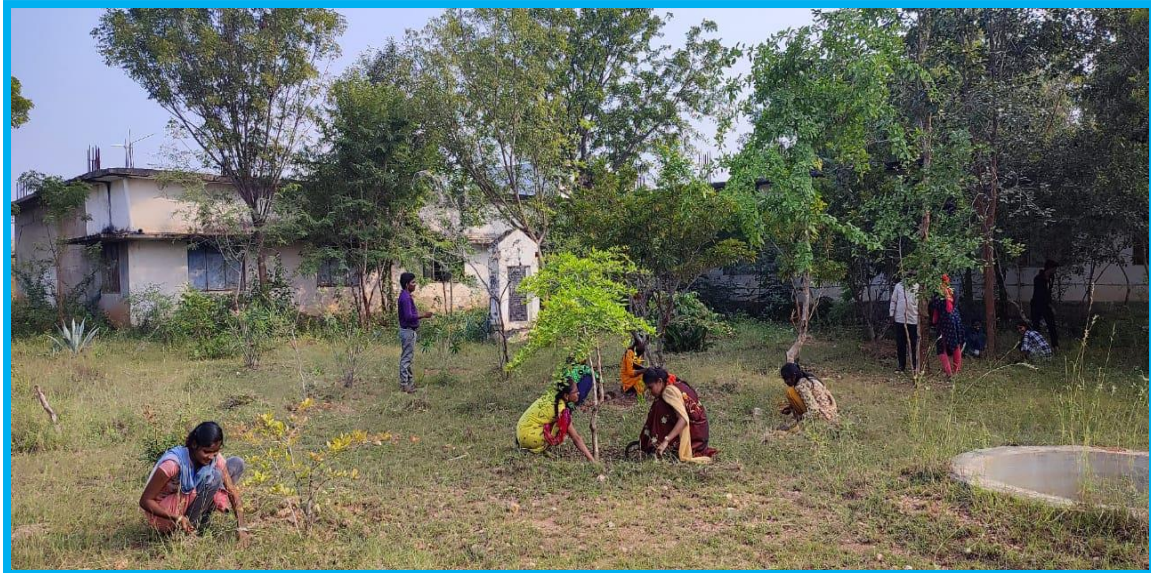
III AND II BZC STUDENTS BOTANICAL GARDEN CLEENING ON 23-12-2022